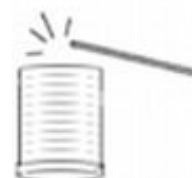
Hit the metal side!