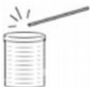
Hit the lid!