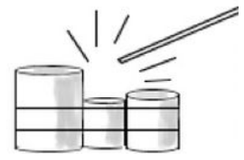
Add more to make a can drumset!